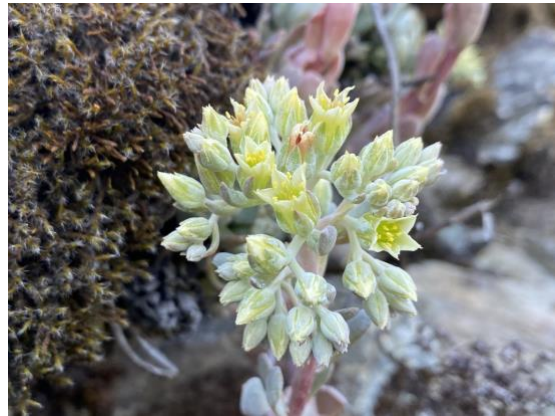
The pale-yellow flowers and bright yellow anthers of Sedum oblanceolatum blooming on Elliott Creek in the Upper Applegate River watershed.

Applegate stonecrop is considered a relictual species that has grown in isolation for long periods of time in a limited geographical area. It also appears that the relatively low elevation habitat of the species has contributed to its isolation and speciation. Unlike more widespread and newly evolved species such as Cream stonecrop ( Sedum oregonense ) and Sierra stonecrop ( Sedum obtusatum ), Applegate stonecrop does not generally create vast clonal colonies. Instead, Applegate stonecrop utilizes more sexual reproduction and seedling establishment for regeneration, rather than the vegetative reproduction that characterizes many related taxa (Denton. 1979).