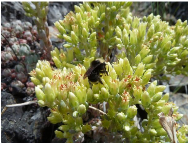
A native yellow faced bumblebee (Bombus vosnesenskii) foraging on Applegate stonecrop flowers.

Particularly robust populations of Applegate stonecrop are found on both Elliott Creek and Teel Creek, growing from layered outcrops of Condrey Mountain schist, a metasedimentary rock type found in a small portion of the Siskiyou Crest in the Upper Applegate and in portions of the Klamath River watershed. It also grows abundantly in the Little Applegate River drainage on the ridges between Anderson Butte and Bald Mountain. These populations grow from isolated metavolcanic outcrops adjacent to sweeping grasslands, disjunct groves of western juniper, chaparral and mixed conifer stands. Large populations can also be found growing from rock outcrops in the mountains and mixed conifer forests between Carberry Creek, the Upper Applegate Valley and Thompson Creek. Additional populations can also be found north of the Applegate River on Long Gulch and in the headwaters of Humbug Creek, yet are absent from the western portion of the Applegate Valley including Williams Creek and downstream to the Rogue River.