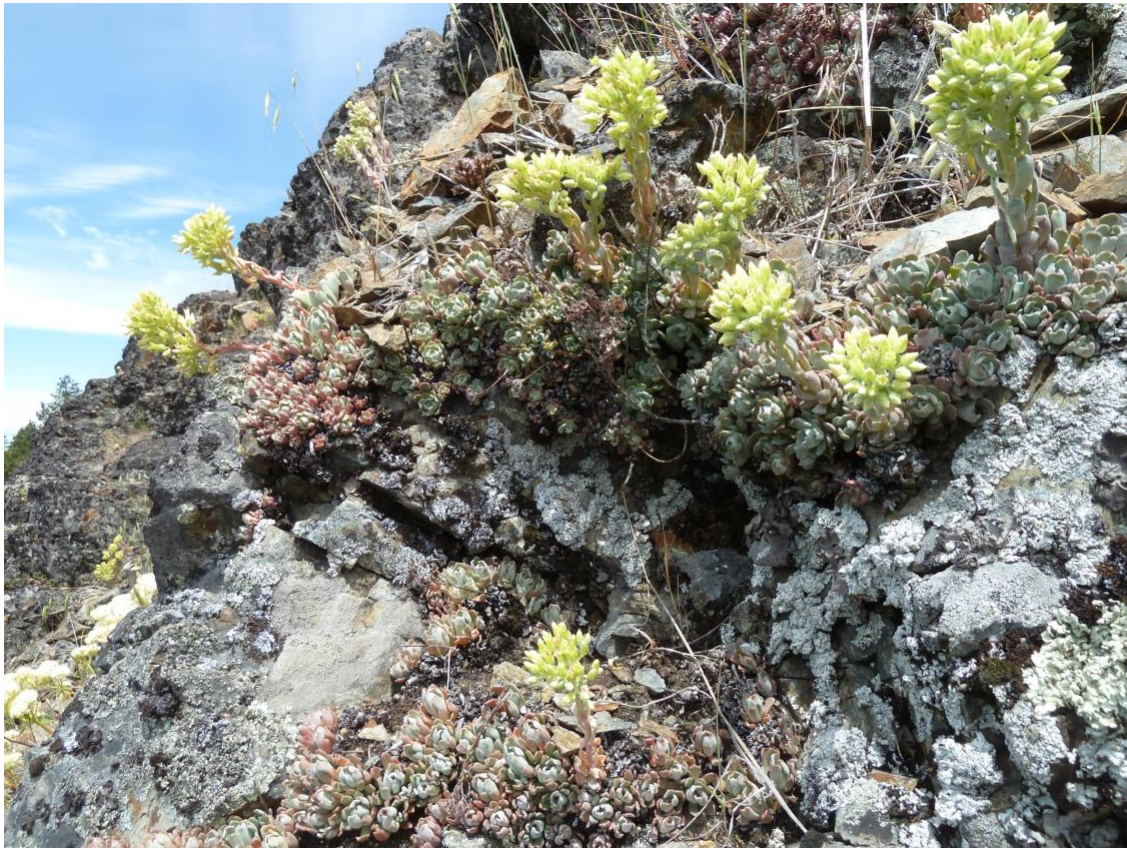
Applegate stonecrop (Sedum oblancheolatum) blooming on metavolcanic outcrops near Anderson Butte in the Little Applegate River watershed.

Applegate stonecrop ( Sedum oblancheolatum ): A central Siskiyou Crest endemic found in the mountains of the Applegate River watershed and adjacent portions of the Klamath River watershed.