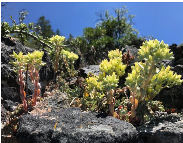
Sedum oblancheolatum blooming on Elliott Creek.

Such genetic divergence has created widespread speciation and variation within species. Currently 17 species in all six groups of the Gormania subgenera are found in the Klamath-Siskiyou Mountains (Zika. 2018). This includes 9 of the 10 species of Sedum endemic to the area, including: S. citirinum , S. eastwoodiae , S. flavidum , S. laxum ssp. heckneri , S. marmoreense , S. oblancheolatum , S. moranii , S. paradisum spp. paradisum , and S. patens . Each of these species tends to be found in a specific geographic area, subrange or niche habitat and is isolated from the others by heavily forested and less hospitable habitats.