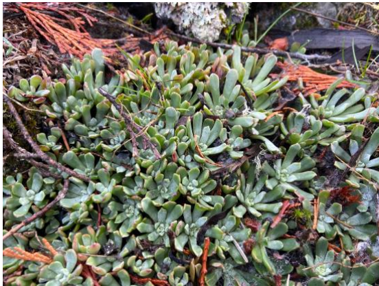
The glaucous foliage of Sedum oblanceolatum on Mt. Isabelle at the headwaters of Forest Creek.

Quite showy and distinctive, Applegate stonecrop is uniquely glaucous with a white, waxy coating covering the young foliage, stems and inflorescences. The granular, waxy coating wears off over time and leaves a white residue on your fingers when handling. The leaves are strap-shaped or oblanceolate, strongly flattened, notched at the tip, and grow in dense rosettes. At times they form dense colonies on rock outcrops or well drained soils. When blooming, the flowers are cream colored, with white to greenish filaments, and yellow anthers.