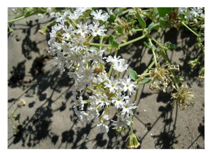
Figure 1. Abronia turbinata inflorescences.

Abronia turbinata (cover photo, Figure 1), transmontane sand verbena, is native to the Great Basin and Mojave Desert in Oregon, Nevada, and California. In Oregon, its range is limited to Harney and Malheur counties in the southeastern corner of the state. Because of this limited range, Oregon Natural Heritage Information Center (ORNHIC) considers it a List 2 species (taxa which are threatened, endangered or possibly extirpated from Oregon, but are stable or more common elsewhere) with a G5