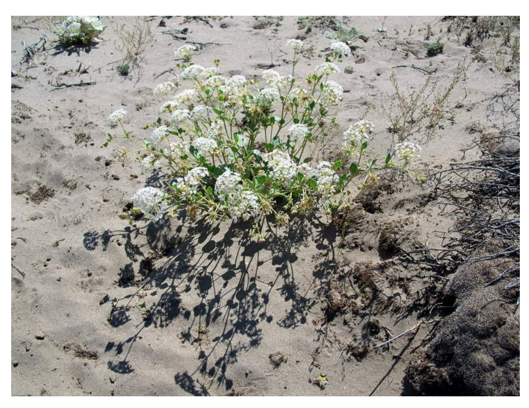
Sand Hills #1 Abronia turbinata.