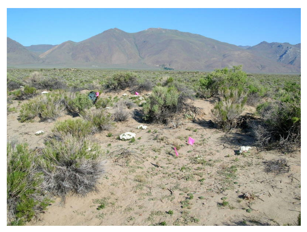
Sand Hills #1 Abronia turbinata (pink flagging) and habitat. The large white flowers are Oenothera caespitosa .