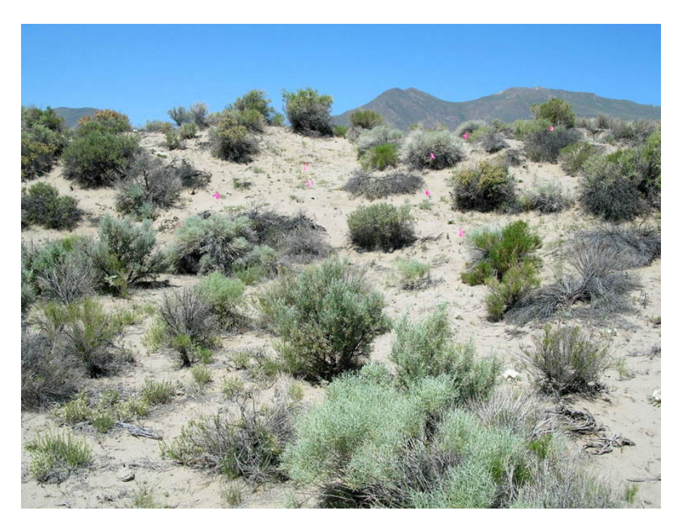
Sand Hills #1 Abronia\ turbinata (pink flagging) and habitat.