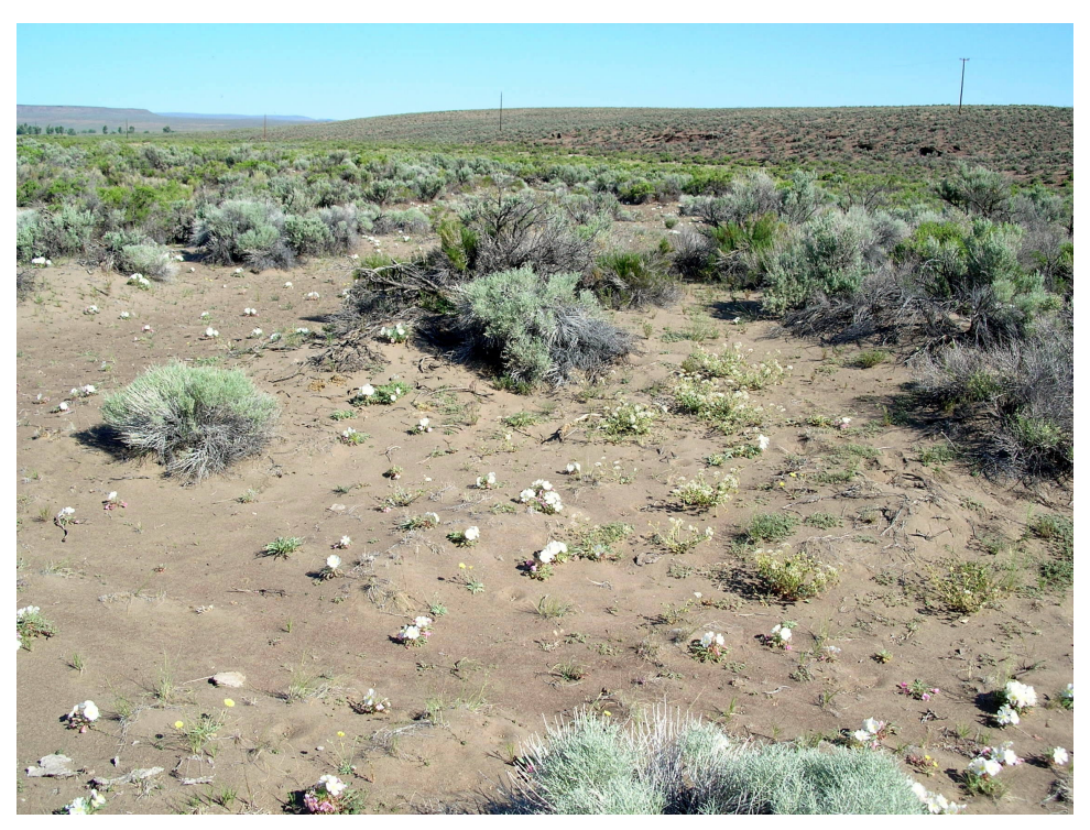
Crooked Creek Abronia turbinata and habitat near eastern end of occurrence; view is facing northwest.