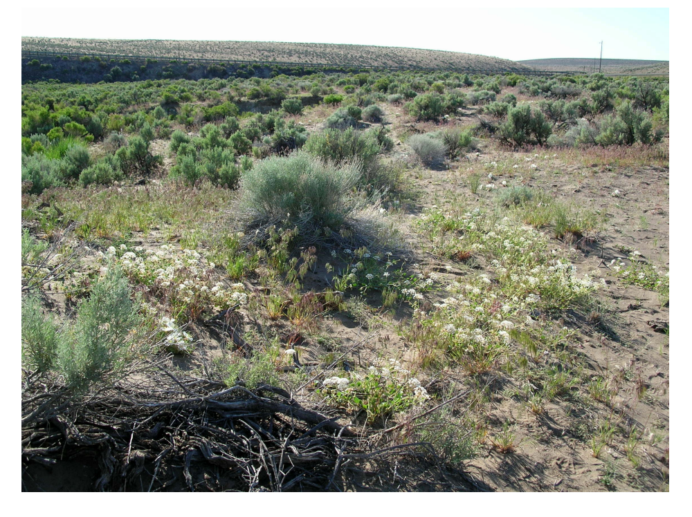
Coyote Lake Abronia turbinata with flowers near western end of occurrence: view is eastward.