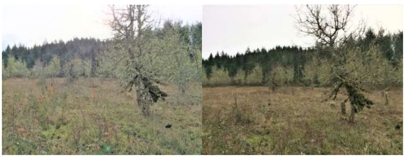
Figure 2. Before (left) and after Scotch broom and Oregon ash removal. (Photos: A. Neill., Dec. 13 2016)