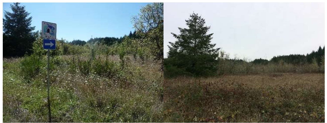
Figure 3. Encroaching woody species in Garoutte Prairie (left) and the same view after most of the trees and shrubs have been removed (right). (Photos: G. Banner, Sept. 12, 2014 and A. Neill., Dec. 13 2016).