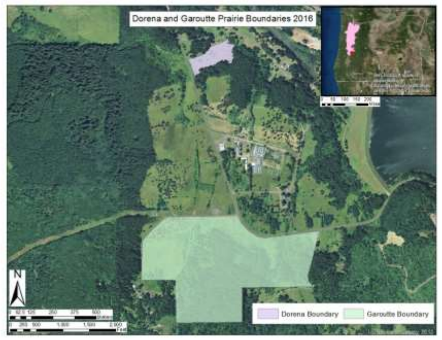
Figure 1: Location of Dorena and Garoutte Prairies

Garoutte Prairie (cover photo) is located in Lane County, Oregon, just west of Dorena Lake along Garoutte Road (Figure 1). The site is managed by the Bureau of Land Management's Northwest Oregon District office. IAE began habitat restoration work at Garoutte Prairie as part of another BLM-funded project at the nearby Dorena Prairie in 2013 (Figure 1, Banner and Axt 2013). The site became an independent restoration project in 2016.