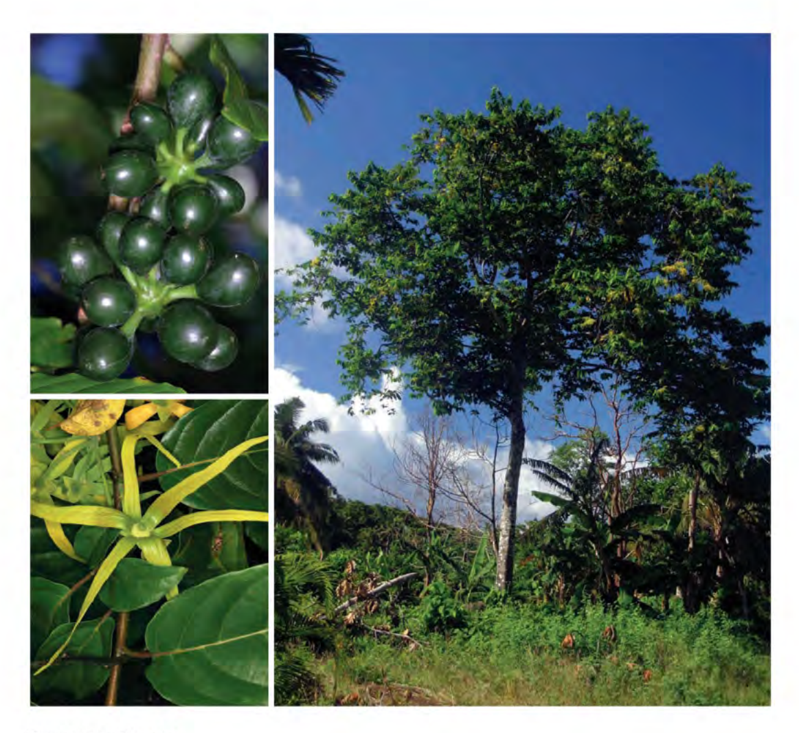
Cananga odorata Moso'oi

Moso'oi is planted all across Polynesia and has a long cultural heritage in Samoa. It is a fast-growing, medium-sized tree with a fairly open crown. The trunk is straight with smooth gray bark. The long, slender branches are well spaced along the trunk and often hang downward with drooping leaves. The flowers are large and bright yellow with six long petals, and found in clusters along the branches. They are perhaps the most intensely scented flowers in all of Polynesia, and can be smelled from long distances. They are bold and sweetly fragrant, and are used in Samoa to scent coconut oil. Flowers are visited by iao and pe'a. The fruits are found in small clusters, and are smooth elongated spheres that are green when immature, and turning purple when ripe. Lupe and manutagi love to eat these fruits. Anyone who plants this species should have visits from birds and bats.