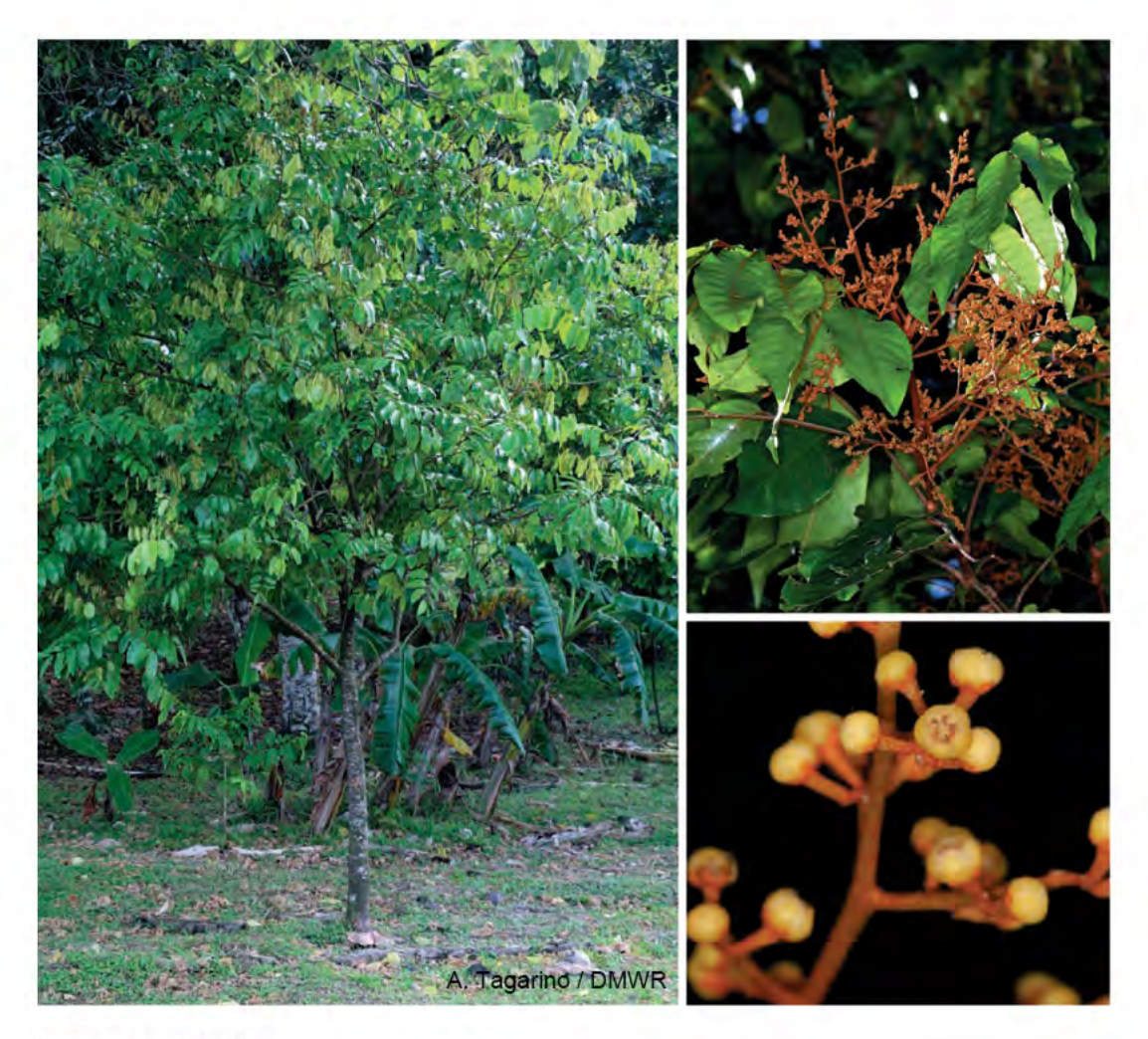
Aglaia samoensis Laga'ali

Laga'ali is only found in the Samoan islands and therefore has special importance as an ornamental. It is a small tree usually less than 5 m height, found in undisturbed lowland forest. If it is grown in moderate light levels, it produces a nice dense crown of leaves and flowers. The greatest ornamental feature of laga'ali is the flower, which is small, cream colored and highly fragrant. These flowers have been used for generations by Samoans to scent coconut oil. Laga'ali fruits are small brown spheres that split open to reveal one or a few seeds. The fruits are probably eaten by birds such as fuia, and possibly lupe. In fact, in the forest, it is difficult to find open fruits that have the seeds; laga'ali is a very popular food for wildlife.