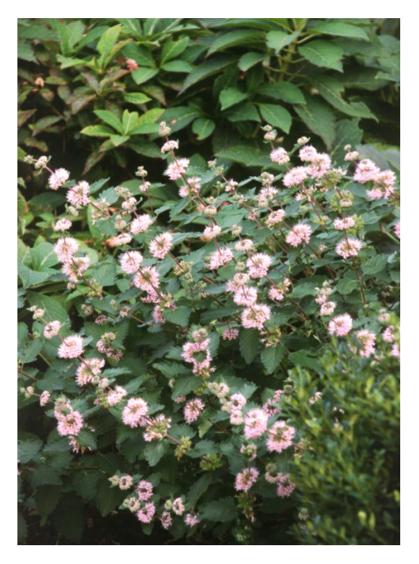
Figure 1. C. × clandonensis 'Durio' Pink Chablis™ growing in a landscape setting.

*: Correct isomer could not identified; RRI;Relative retention indices calculated against n -alkanes; % calculated from FID data; Identification method, t_{\rm R} , identification based on the retention times of genuine compounds on the HP Innowax column; MS, identified on the basis of computer matching of the mass spectra with those of the Wiley and MassFinder libraries and comparison with literature data.