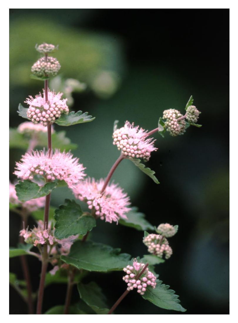
Figure 3. Close-up of the flowers of C . × clandonensis 'Durio' Pink Chablis™. (Photo by Spring Meadow Nursery, Inc.)

Figure 2. Inflorescences of C . × clandonensis 'Durio' Pink Chablis™. (Photo by Spring Meadow Nursery, Inc.)