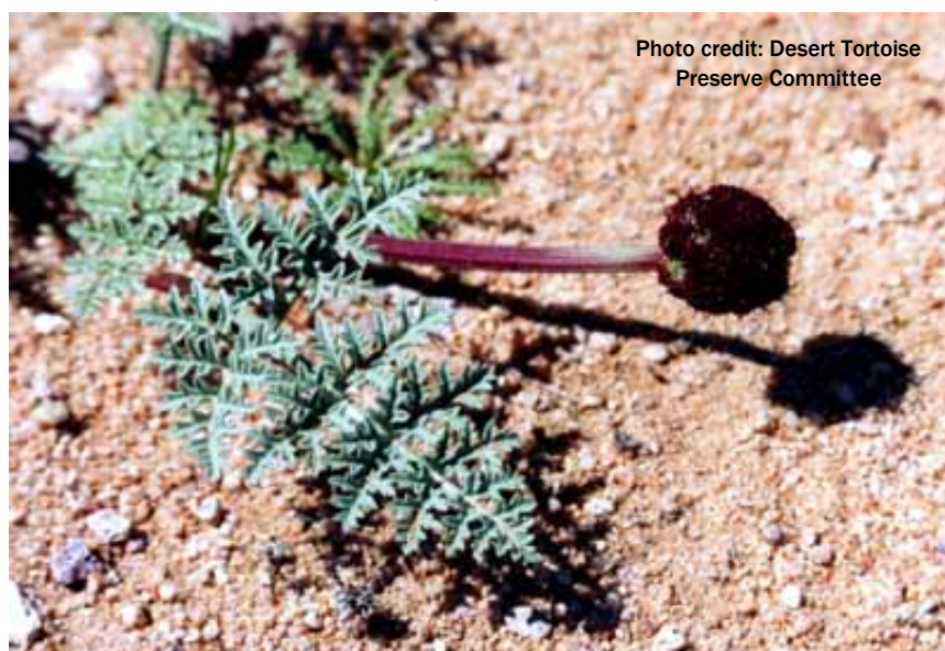
Figure 6. Desert cymopterus ( Cymopterus deserticola ), a Mojave Desert endemic known to occur on Edwards AFB, was estimated to have the highest priority score of any species.

Examining the representation of species with the top ten percent of priority scores within Services, we found that species were distributed across 8 of 36 installations (Table 11). As is expected, Services with a larger number of species had a greater number of species with high priority scores than Services with fewer species. Of more interest to Services and installations is the representation of species with high priority scores among installations and the management implications of the criteria that resulted in high priority scores (see next Section).