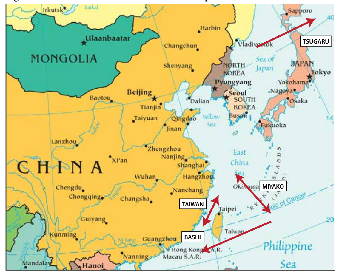
Figure 2. 2004–2009 PLAN Western Pacific Chokepoint Transits

execution of these operations further enhances the PLAN ability to execute near seas active defense and improve capabilities that are also germane to new historic missions.