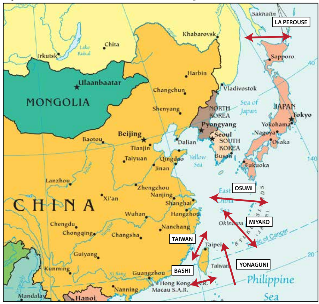
Figure 4. 2013–2014 PLAN Western Pacific Chokepoint Transits

A third likely signal to Japan came from PLAN utilization of the La Perouse Strait following a bilateral exercise with the Russian Navy. Five PLAN ships transited east through the La Perouse Strait and circumnavigated Japan rather than using a direct route and transiting back through the Sea of Japan to their North Sea Fleet homeport following the Vladivostok-based exercise.<sup>87</sup> This deployment illustrates an expansion of SLOCs used by the PLAN to access the Western Pacific; more significantly, Chinese Navy officials referred to the transit as "cutting the