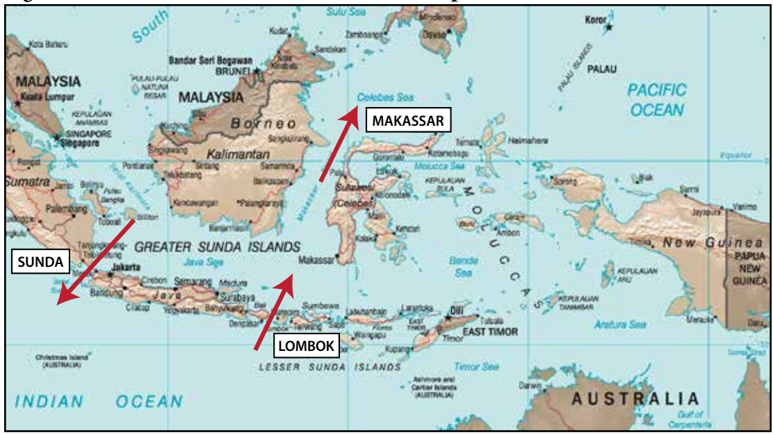
Figure 5. 2013–2014 PLAN Indian Ocean Chokepoint Transits

Chinese press covered this deployment extensively, referring to the operation as a "combat readiness patrol." This terminology is important because it is normally reserved for PLAN patrols in the near seas. A combat readiness patrol that included antisubmarine warfare training in the Indian Ocean suggests the PLAN is beginning to extend its combat capabilities out from the near seas and operationalize a far seas defense doctrine.