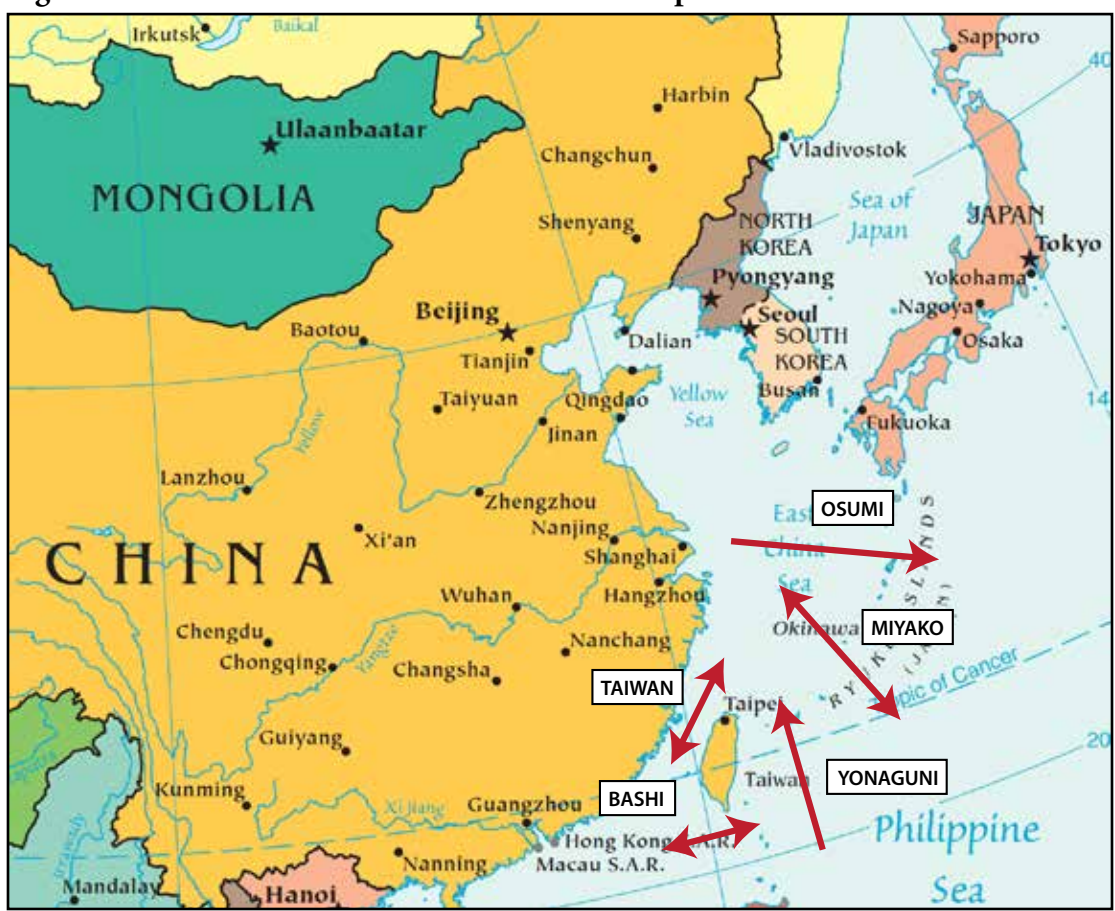
Figure 3. 2010–2012 PLAN Western Pacific Chokepoint Transits

The PLAN diversified access routes to the Pacific Ocean from 2010 to 2012. While the Miyako was the most frequently used channel, the PLAN also used the Osumi Channel and the Yonaguni Channel for the first time (see figure 3). The diversification of access routes to the