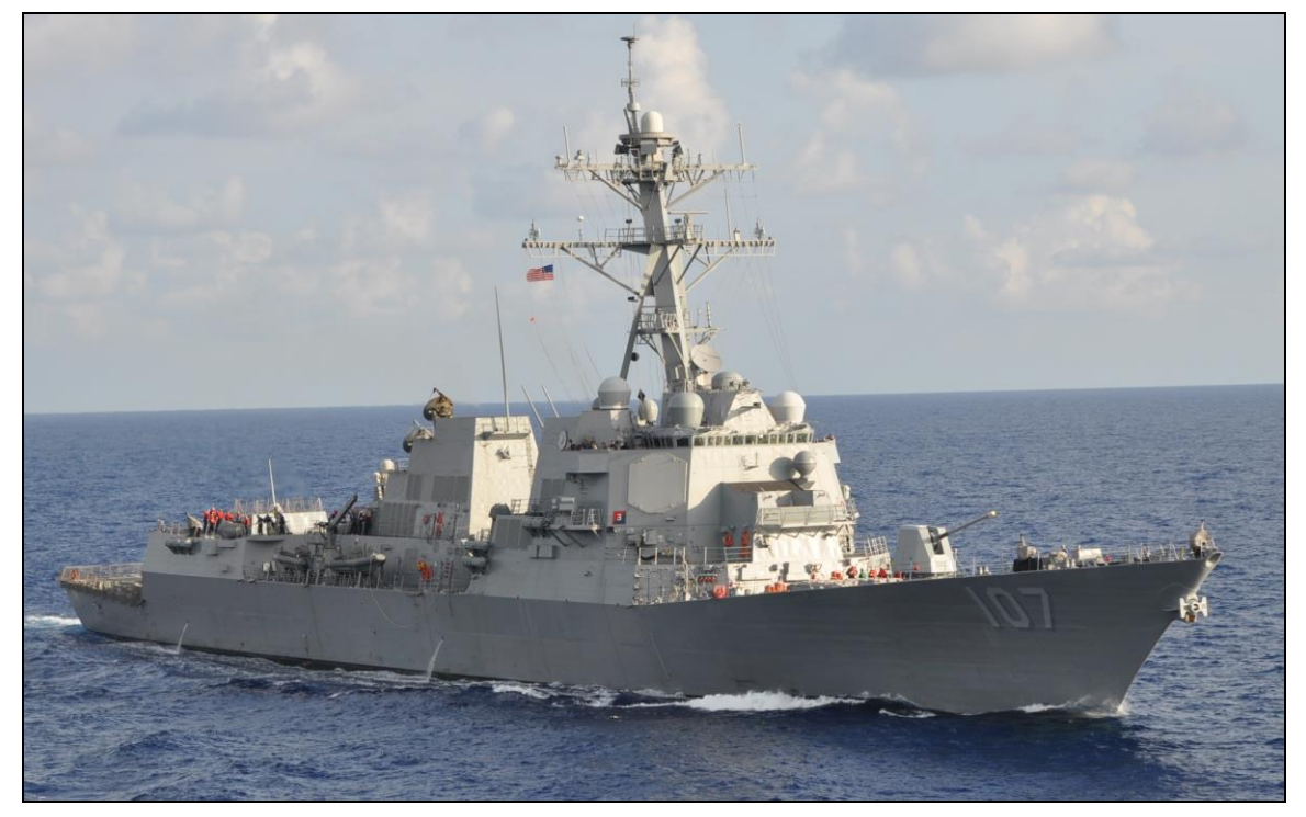
Figure 1. DDG-51 Class Destroyer

than DDG-51s.<sup>5</sup> The first DDG-51 entered service in 1991, and a total of 62 were in service as of the end of FY2014. DDG-51s are built by General Dynamics Bath Iron Works (GD/BIW) of Bath, ME, and Ingalls Shipbuilding of Pascagoula, MS, a division of Huntington Ingalls Industries (HII).