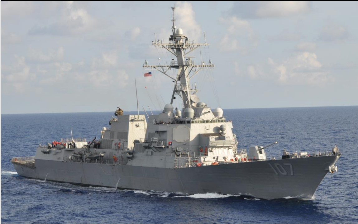
Figure I. DDG-51 Class Destroyer