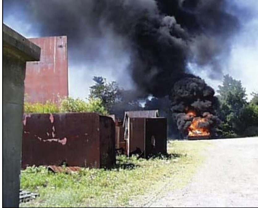
The containers are engulfed in flame during the test.

All munitions acquired by the military services must be examined to determine if they meet established IM requirements. This is true whether the munitions are developed by the services or procured from commercial or foreign sources. This examination normally involves a series of six tests designed to assess the ability of munitions (typically in their shipping configuration) to withstand shock, heat, and impact. The specific tests are identified during a threat hazard assessment conducted by the acquiring service. The six tests normally include fast cookoff, slow cookoff, sympathetic detonation, bullet-impact, fragment-impact, and shape-charge jet impact tests. These test requirements, methods of conduct, and passing criteria can be found in Military Standard (MIL-STD)-2105, Hazard