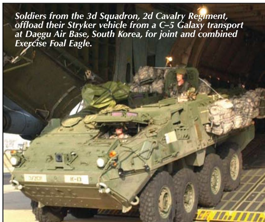
Soldiers from the 3d Squadron, 2d Cavalry Regiment, offload their Stryker vehicle from a C-5 Galaxy transport at Daegu Air Base, South Korea, for joint and combined Exercise Foe Eagle.

The joint logistics environment is characterized by the Global War on Terrorism, other threats to our security, frequent and diverse commitments around the world, and complex interagency and multinational operations. Future operations are likely to be distributed and conducted rapidly and simultaneously across