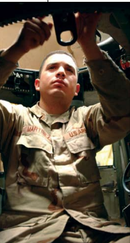
A Soldier installs a gunner's harness bracket on a humvee. This gunner restraint keeps the Soldier from being ejected during a rollover or sudden stop.

equipment enhancements, thereby putting their vehicles and crews at risk from attacks while in transit. The use of fly-away teams spares customers from the dangers that can be encountered in traveling on Iraqi roads. As the team's noncommissioned officer in charge, Staff