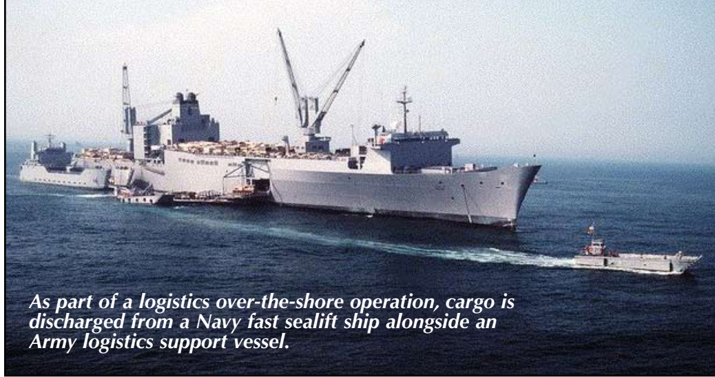
As part of a logistics over-the-shore operation, cargo is discharged from a Navy fast sealift ship alongside an Army logistics support vessel.

The operational level is where the JFC synchronizes and integrates his joint operational requirements with the national system. It is there that joint logistics must excel and where the ability to fully integrate logistics capabilities provides our greatest opportunities. The