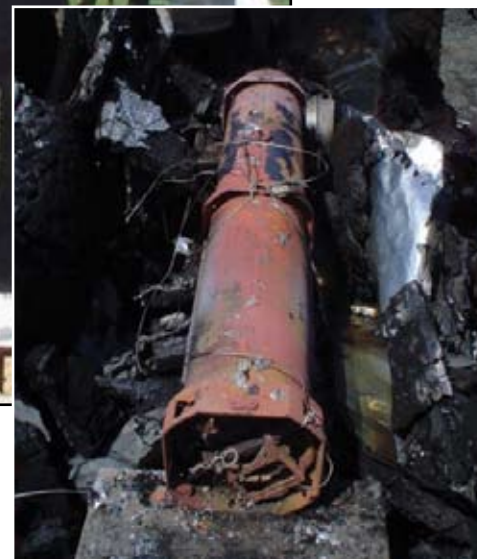
Above, a MACS container is positioned for a slow cookoff test. At right, the container is shown after a successful test in which the munition did not explode.

Bullet- and fragment-impact tests are performed to check a munition's reaction to small-arms fire and impact from high-speed fragments that may come from sources such as exploding bombs or artillery shells. Depending on the threat-level assessment (what the Army thinks might be fired at the particular type of munition being tested), various rounds are fired at the munition in its container. The projectiles vary from 5.56 millimeters up to .50 caliber for the bullet-impact test. Both armor-piercing and ball ammunition are used. The Department of Defense has developed more specific criteria for the fragment-impact test, which includes size, shape, and speed of the fragment. If the munition's reaction is no worse than burning and no hazardous fragments are thrown, it passes these tests.