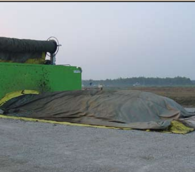
Waste heap is placed on top of the aeration tubes, and the cover is laid over the heap. Temperature- and oxygen-monitoring probes are installed in the heap through the cover.