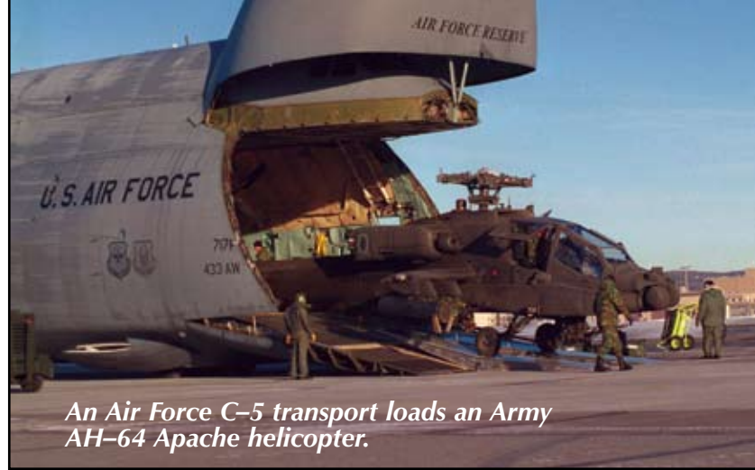
An Air Force C-5 transport loads an Army AH-64 Apache helicopter.

• Efficiency is directly related to the supply chain’s footprint. In the tactical and operational space, the footprint needed to provide support can be determined by the resources needed to compensate for inefficiencies within the supply chain itself.