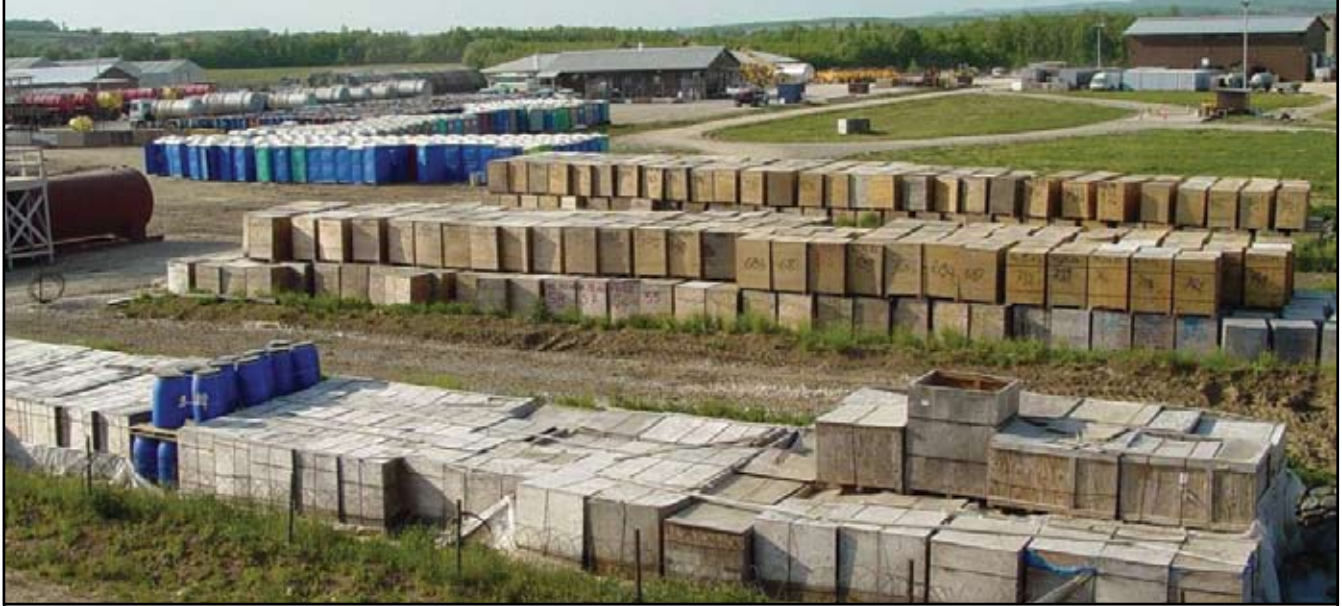
Over 1,000 boxes of sewage sludge are stockpiled at Camp Bondsteel in Kosovo. All of the sewage sludge in this photo was composted during the early days of the pilot study in 2004.

During the initial 3-week processing period, bacterial activity is controlled as the computer automatically adjusts the air flow to maintain optimum temperature and oxygen levels in the heap. Internal compost temperatures easily reach 150 to 165 degrees Fahrenheit. After the initial 3-week period, the compost heap is uncovered and moved to the opposite side of the ISO container. The heap then is treated using the same procedure for an additional 3 weeks. After the total 6-week period, the compost is ready to be tested and used for soil amendment.