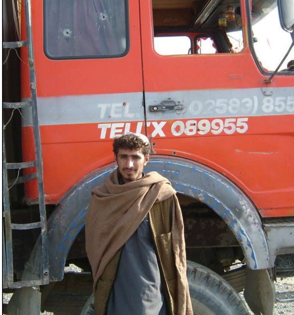
A contracted Afghani driver stands beside his bullet-riddled "jingle truck."

The use of contractor logisticians has increased significantly in the last decade. Theater commanders have adapted rapidly and have provided sustained force protection to the many contractor convoys operating in the theaters. However, because of the limitations of unarmed contracted civilians, the adaptive techniques of terrorists and insurgents, and a limited number of trained military police and other combat and support units available for convoy security missions, contractor convoy force protection remains a challenge in theater. Now more than ever before in our history, the