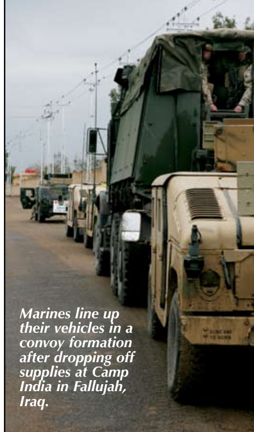
Marines line up their vehicles in a convoy formation after dropping off supplies at Camp India in Fallujah, Iraq.

• Connectivity requires access to the information network 24 hours a day, 365 days a year. The objective of connectivity is to reach globally—backward, forward, and laterally—throughout the network to synchronize and coordinate the efforts of supporting Defense agencies, interagency participants, multinational partners, host nations, contractors, and commercial sector participants.