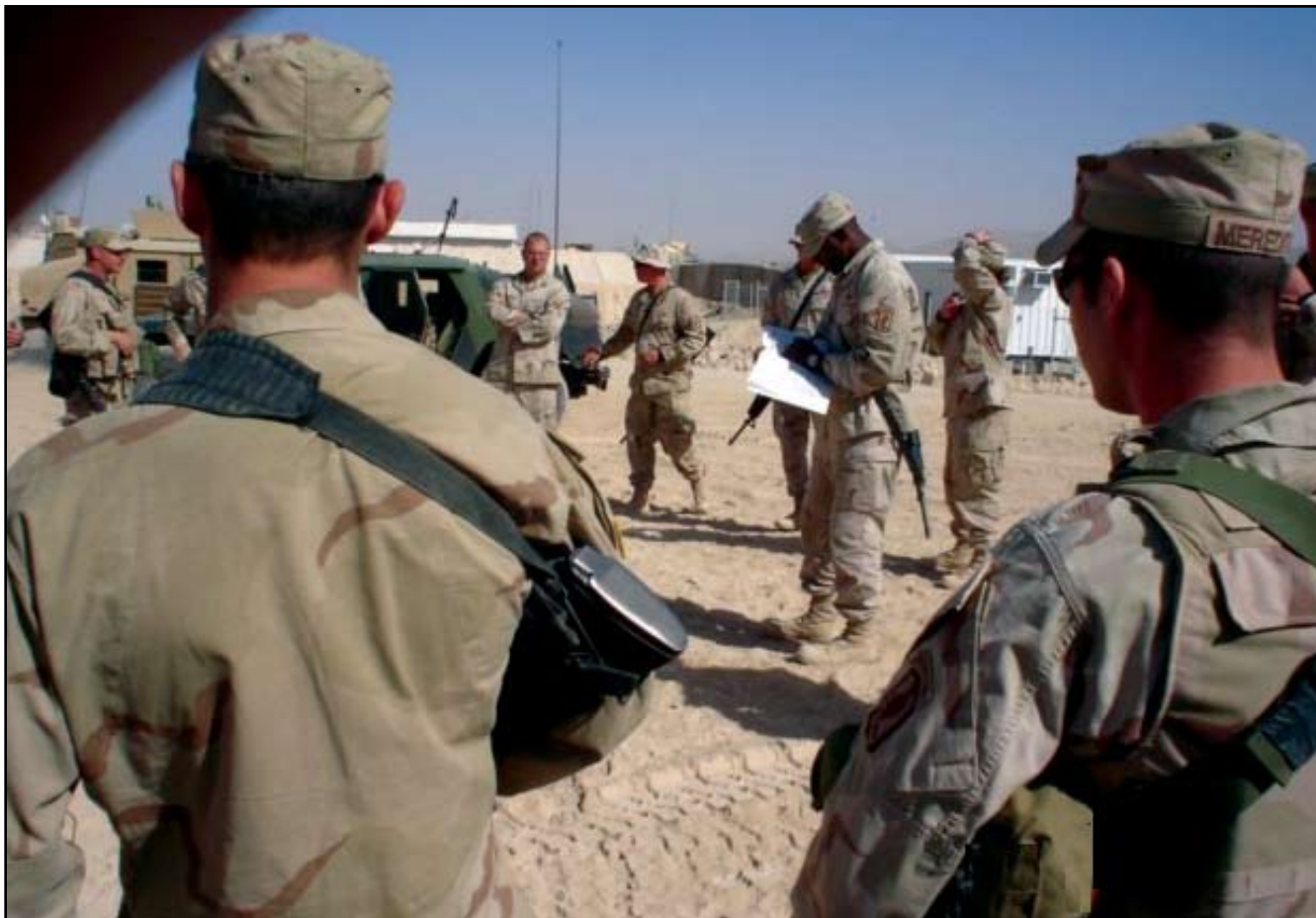
In southern Afghanistan, Soldiers of the 173d Support Battalion (Airborne) are briefed on an upcoming combat logistics patrol.

The rehearsal agenda shows which vehicles are in the line of march; where the weapons check will be conducted; the start point location; the route of march; key terrain features along the route; chokepoints; potential problems associated with driving through urban areas; potential ambush areas; and actions to be taken on contact, when crossing friendly boundary lines, moving into a friendly forward operations base, and at the release point. To be effective, the rehearsal must include everyone in the CLP and use a terrain model that is similar to the area the CLP will cover. The rehearsal area should be quiet and free of distractions. The CLP leader should ask the Soldiers questions during and after the CLP rehearsal to ensure that everyone understands the mission.