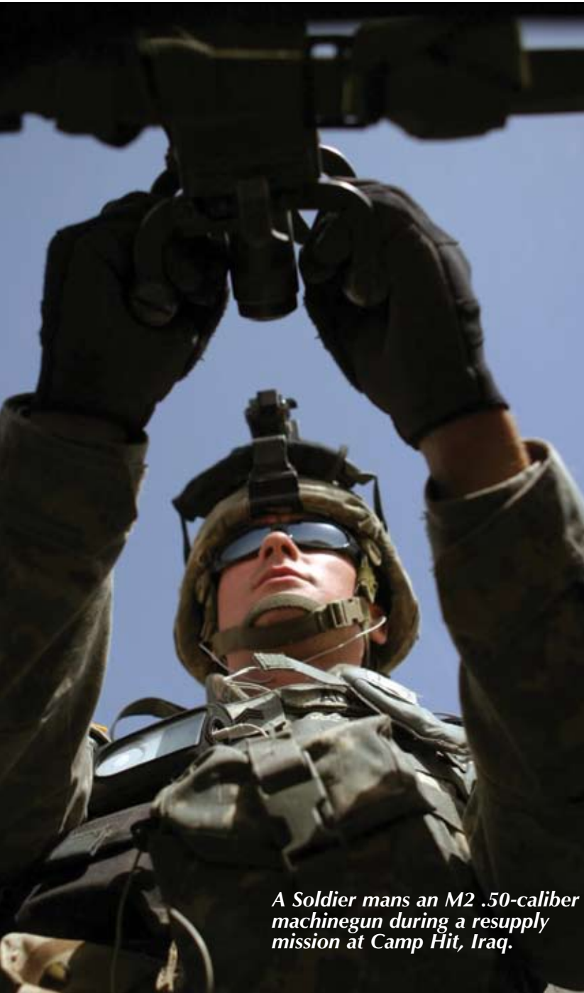
A Soldier mans an M2 .50-caliber machinegun during a resupply mission at Camp Hit, Iraq.

Now more than ever before in history, the support of U.S. military forces is inherently tied to the success of contractors on the battlefield.