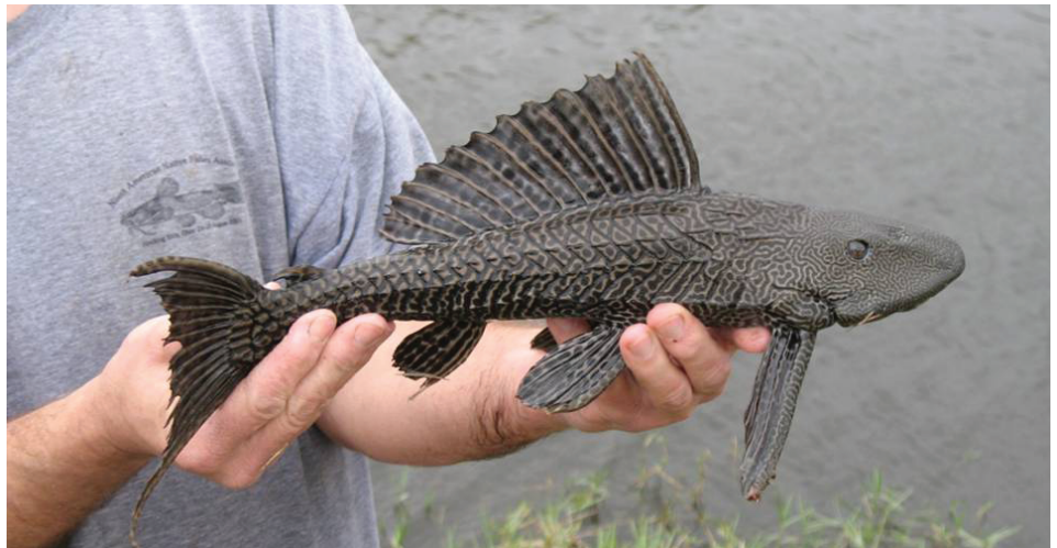
Figure 2. Sailfin catfish ( Pterygoplichthys sp.) from southern Florida. Note dorsal fin with single spine and 12 soft rays.