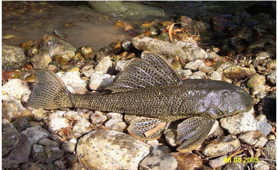
Figure 1. Armadillo del rio ( Hypostomus sp.) from the San Antonio River, Texas. Note dorsal fin with single spine and seven soft rays. Appearance is consistent with that of Hypostomus niceforoi .

In addition to their remarkable boney armor, other adaptations of suckermouth catfishes enable them to survive environmental extremes, food limitations, and predation. A large, vascularized stomach functions as a lung and as a swim bladder allowing fish to breathe