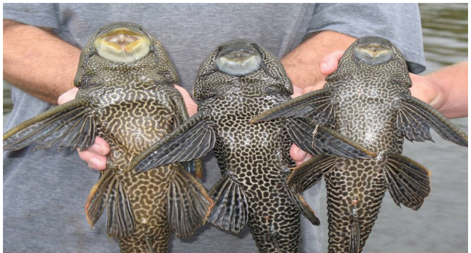
Figure 3. Ventral pigmentation of sailfin catfishes from south Florida. Appearance of fish at left is consistent with that of P. disjunctivus , appearance of fish at center and right with that of P. pardalis or hybrids.