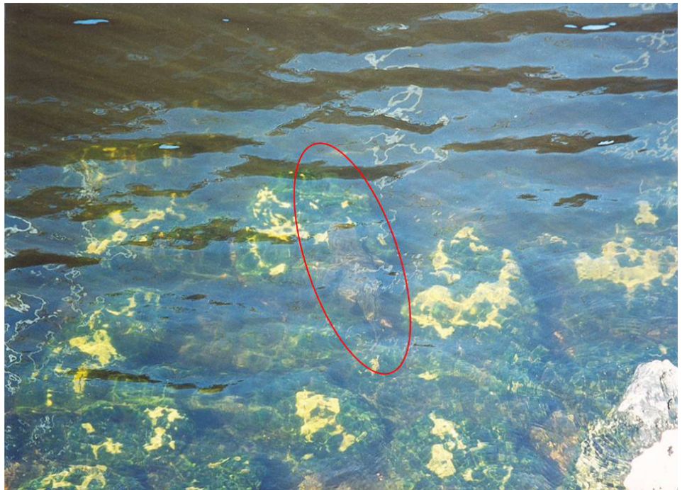
Figure 4. Submersed boulders in the Caloosahatchie River, Florida. White bands are grazing scars denuded of algae by suckermouth catfishes. A sailfin catfish ( Pterygoplichthys sp.) is present in the center of the picture (within red circle).

Suckermouth catfishes are believed to compete for food with smaller fish, disturb nest sites excavated in algae, and ingest eggs. In Texas, they have been implicated in declines of algae-eating central stonerollers ( Camptostoma anomalum ) in the San Antonio River (Hubbs et al. 1978), and are