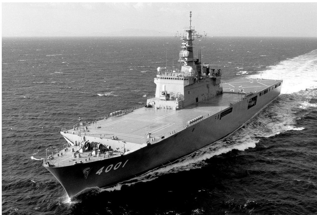
JS Oosumi (LST 4001)