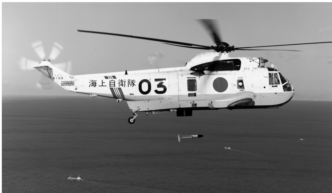
HSS-2B with MAD and radome extended