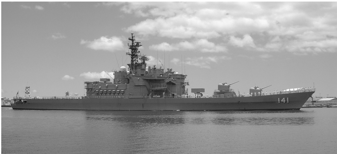
JS Haruna (DDH 141)