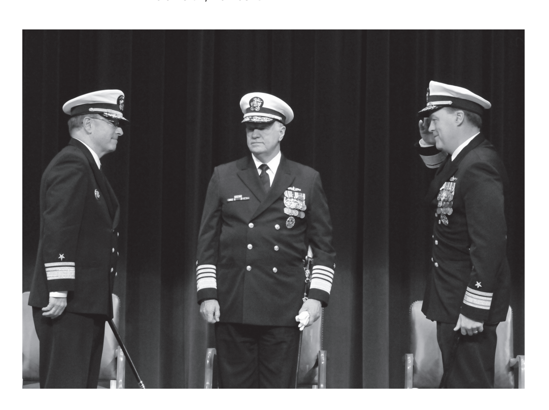
Summer 2011 Volume 64, Number 3