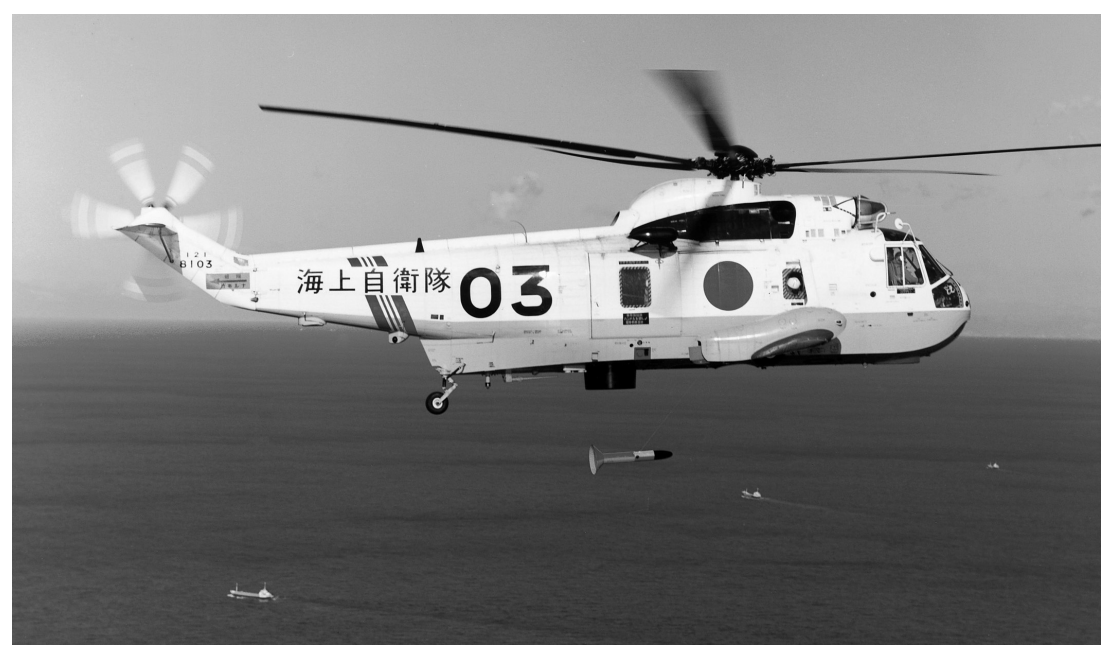
HSS-2B with MAD and radome extended IMSDE

In the eight ships/eight helicopters composition, only one aircraft was embarked on each DD. However, to provide operational flexibility, the enlargement of their hangar bays to accommodate two ASW helicopters (a type known generically as HS) was attempted; the hangar on board JS Asagiri was modified during construction. That attempt was not satisfactory; however, in the next class, beginning with JS Murasame, provision was made in the design phase to accommodate two SH-60J/Ks at one time. This is officially known as the "one HS embarked and one HS carried" design, and it greatly improved flexibility in missions in the Indian Ocean (supporting ENDURING FREEDOM) and off the coast of Somalia (antipiracy). However, these operations are considered to be variations, adaptations of the fundamental eight ships/eight helicopters concept.