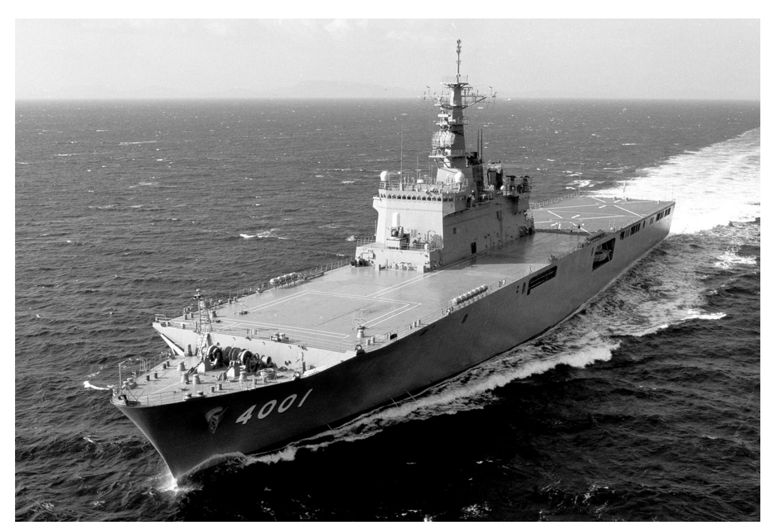
IS Oosumi (LST 4001) Sekai no Kansen