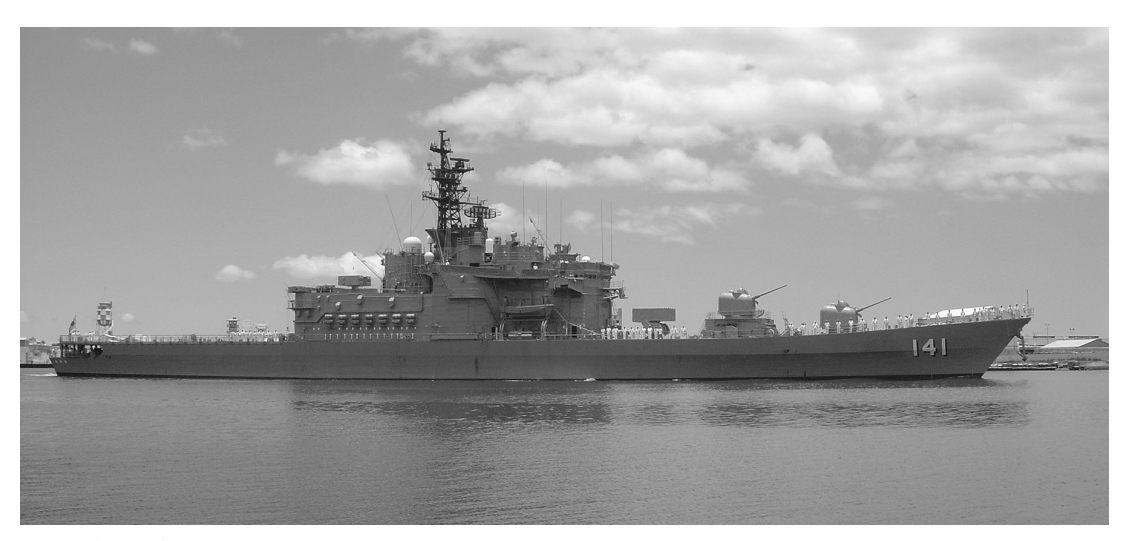
JS Haruna (DDH 141) Sekai no Kansen

Escort Division 51 was organized; Hiei and Haruna joined its Escort Flotilla 1. The third DDH, of a slightly larger (seven-thousand ton) class, was JS Shirane (DDH 143), commissioned in March 1980; with the commissioning of the fourth, JS Kurama (DDH 144), the next year, Escort Division 52 was formed, and the two Shirane-class DDHs were assigned to its Escort Flotilla 2.