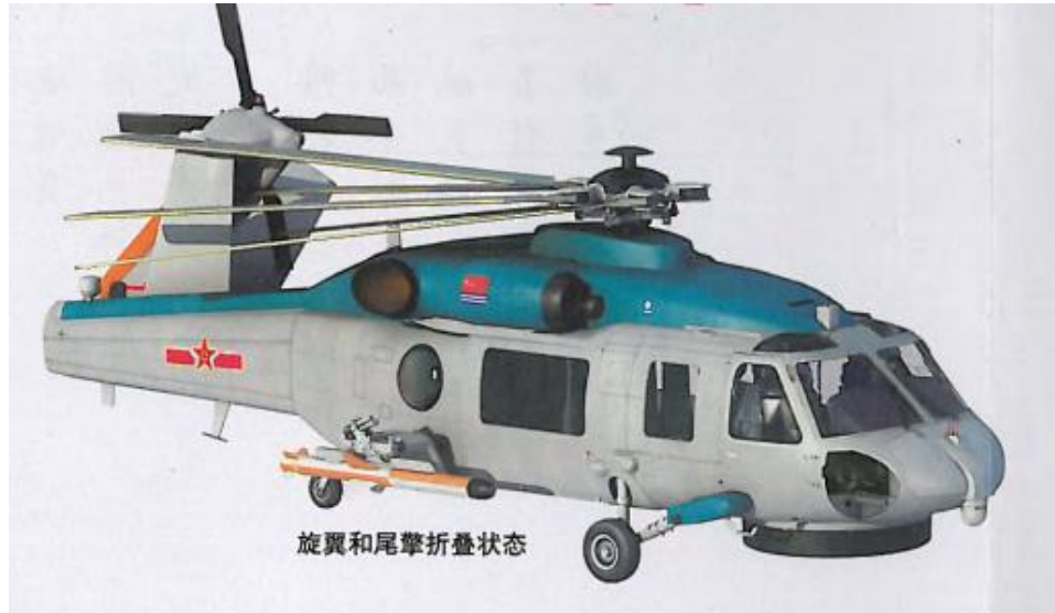
Image 9. This is a graphic depiction of China’s new Z-20 shipborne helicopter – a rather close copy of the highly effective American SH-60. Shipborne helicopters have long been a weakness for the PLAN and it has relied on the Russian-imported Ka-28. However, the Z-20, along with the larger Z-18, could substantially improve the Chinese Navy’s capabilities in this crucial domain.

destroyer will be easily attacked by submarines have no basis at all” (美国媒体称中国新型驱逐舰易遭潜艇攻击并没有足够的依据). 116