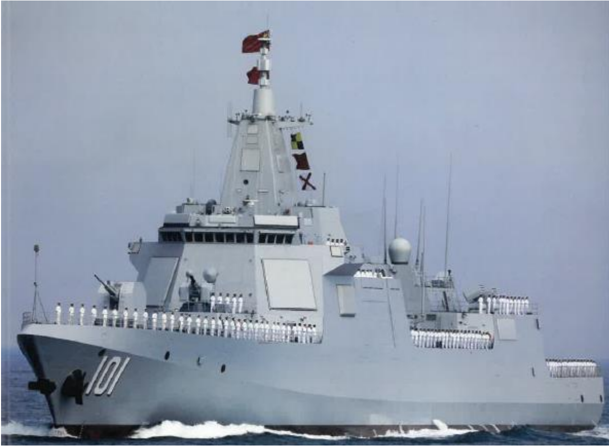
Image 11. The PLAN's first Type 055 cruiser Nanchang on parade. Along with the aircraft carriers, these capable warships are symbolic of China's ambition to wield a global navy.

that the U.S. Navy last engaged in high-intensity fleet-on-fleet combat involving submarines, it will be helpful to approach these vexing strategy questions with a decent amount of humility.