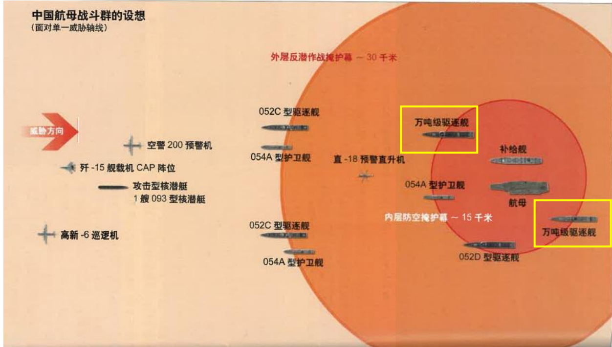
Image 8: This notional sketch of a Chinese aircraft carrier battle group features two Type 055 cruisers (designated by yellow squares inserted by authors) in close proximity to the Chinese carrier. This graphic may imply that the most important mission of the new Chinese cruiser is actually air and missile defense for the PLAN’s new carrier groups.

weapon conflict.” 113 There is evidence, moreover, that Chinese naval analysts are studying American doctrine on this subject, including such delineations as the “fighter engagement zone” (FEZ), the “joint engagement zone” (JEZ) and “missile engagement zone” (MEZ). 114