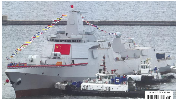
Image 1. The Type 055 cruiser is significantly larger than its predecessors and reveals a new confidence in Chinese warship design.

With a displacement exceeding 12,000 tons, Type 055 is nearly double the tonnage of its Chinese destroyer predecessor and 23 meters longer. 7 In an age when naval strategists had generally considered large surface combatants to be excessively vulnerable to torpedoes and anti-ship cruise missiles, the Chinese Navy appears to be turning conventional wisdom on its head. Instead, Chinese strategists assert that a close reading of recent naval history reveals the advantage of “going large” (大型化) when it comes to warship design. 8 The program amounts to a bold assertion that China intends to wield a large and capable fleet across the world’s oceans. In a military sense, this assertion also indicates a certain faith prevailing in Beijing that China has mastered the requisite technologies to guard such prized capital ships. For naval strategists, therefore, the commissioning of the first Type 055 in January 2020 may represent a Dreadnought (1906) or even Bismarck (1939) type moment. 9 The launching of these two famous ships dramatically altered the naval strategy landscape in their day. The same might well be said a few decades hence regarding the advent of Type 055.