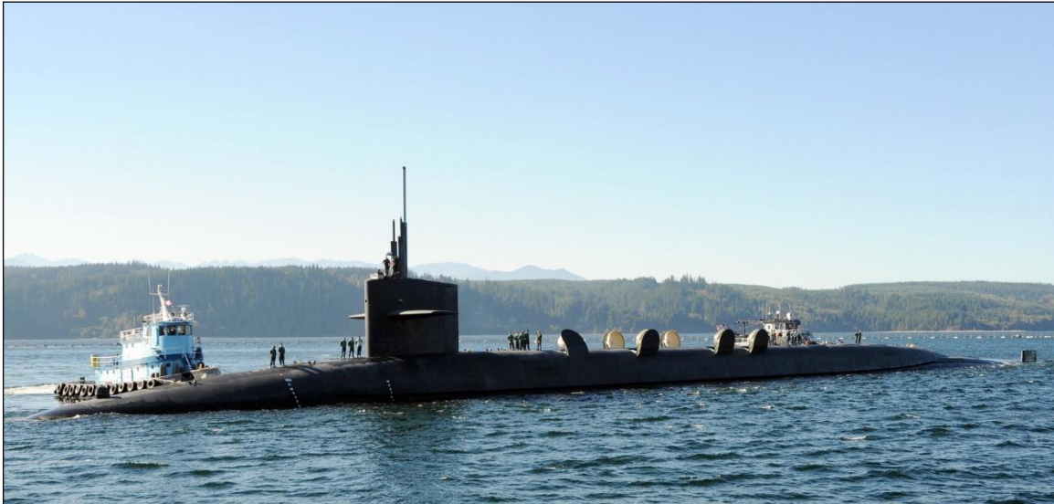
Figure I. Ohio (SSBN-726) Class SSBN With the hatches to some of its SLBM launch tubes open