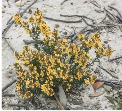
Flowering plant. Nadgee.