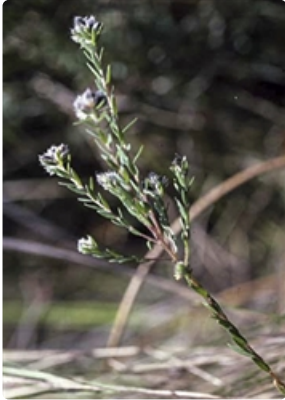
Plant with spent flowers. Darkes Forest, NSW