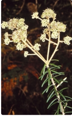
Flowering stem. southern edge of Bournda National Park near Tura Beach