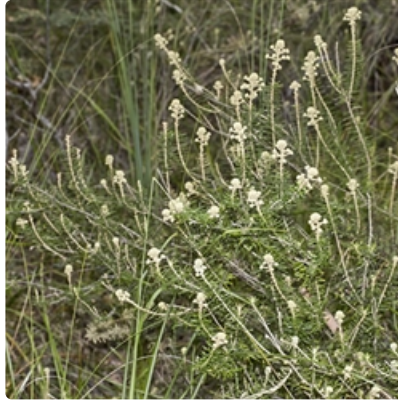
Flowering shrub. Bournda National Park south of Tathra