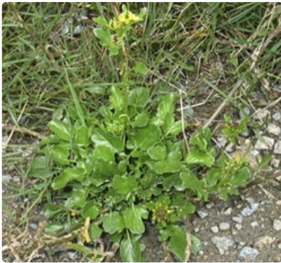
Flowering plant. Kosciuszko National Park