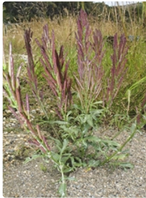
Seeding plant. Photographer Jackie Miles, Kosciuszko National Park