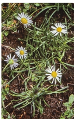
Flowering plants. South East Forests National Park