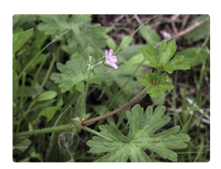
Flower and leafy stems.