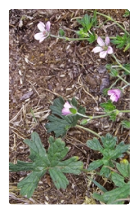
Flowers and leaves. Photographer Don Wood, Namadgi National Park, ACT