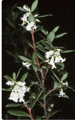
Flowering branches. Wadbilliga National Park