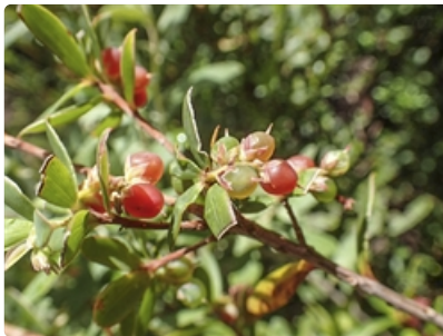
Fruiting branch.