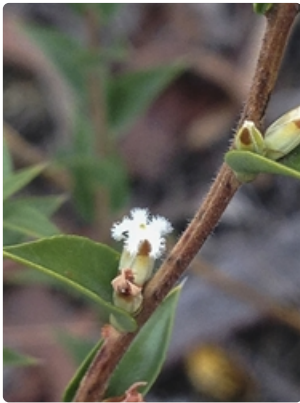
Flowering stem. near Bendigo.