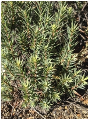
Shrub.