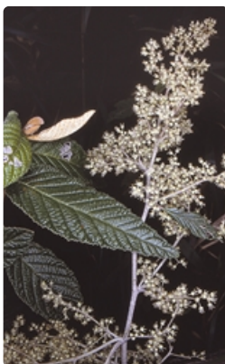
Flowering stems.