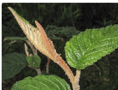
New growth.