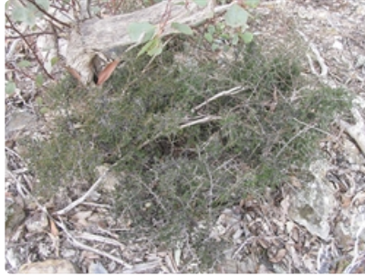
Shrub. Werribee Gorge State Park, Vic