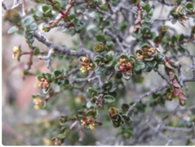
Flowering branches. Werribee Gorge State Park, Vic