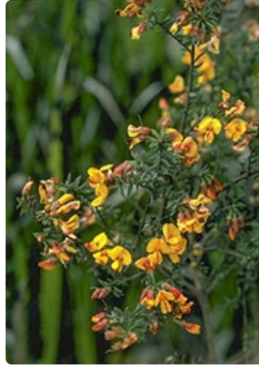
Flowering stems. between Bugendore and Braidwood