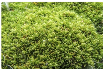
Flowering cushion.