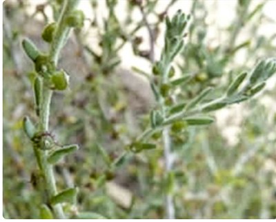
Burrs and leaves. Unknown photographer, Trust for Nature, Ned's Corner Station Reserve via Lake Oulleraine, Vic