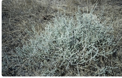
Shrub. Conargo to Hay