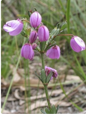
Flowering stem (subsp. latifolia ).