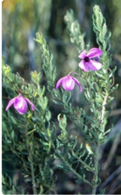
Flowering stems (subsp. latifolia ). Ben Boyd National Park south of Eden