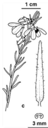
Line drawings (subsp. pilosa ). c. flowering branch; leaf with transverse section. MMBir, National Herbarium of Victoria, © 2021 Royal Botanic Gardens Board