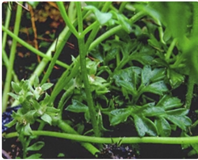
Flowers (spent?) and leaves. Marysville north of Melbourne, Vic