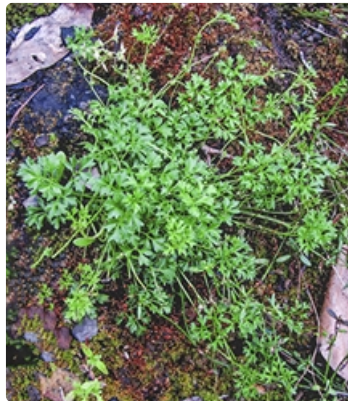
Plant. Marysville north of Melbourne, Vic