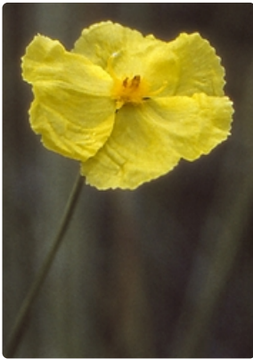
Flower. Jervis Bay, NSW