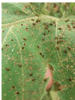
Photo 7. Large swarm of tobacco flea beetle, Epitrix hirtipennis , on eggplant.