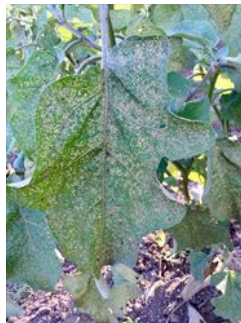
Photo 6. Severe damage on eggplant by the tobacco flea beetle, Epitrix hirtipennis .