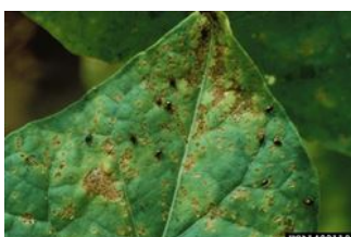
Photo 8. Irregular patches on leaf of tobacco where surface layers have been chewed by the tobacco flea beetle, Epitrix hirtipennis .