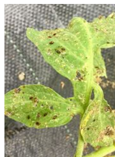
Photo 3. Tobacco flea beetle, Epitrix hirtipennis , feeding on tomato