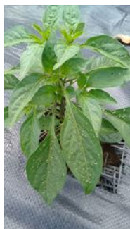
Photo 9. Symptoms of tobacco flea beetle, Epitrix hirtipennis , on capsicum.