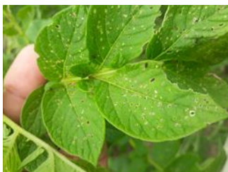
Photo 10. Symptoms of tobacco flea beetle, Epitrix hirtipennis , on potato.