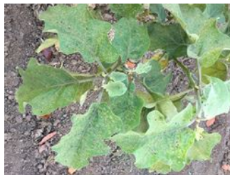
Photo 5. Severe damage on eggplant by the tobacco flea beetle, Epitrix hirtipennis .

When using a pesticide (or biopesticide), always wear protective clothing and follow the instructions on the product label, such as dosage, timing of application, and pre-harvest interval. Recommendations will vary with the crop and system of cultivation. Expert advice on the most appropriate pesticide to use should always be sought from local agricultural authorities.