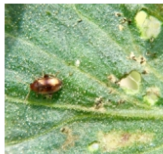
Photo 4. Adult tobacco flea beetle, Epitrix hirtipennis , and holes eaten in a tomato leaf.