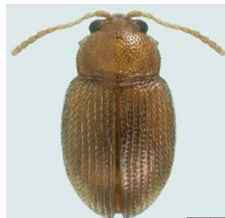
Photo 1. Adult tobacco flea beetle, Epitrix hirtipennis . Note, the long antennae.

Look for the pits and tiny holes, many less than 1 mm, in leaves of seedlings and mature plants. Look for beetles, shiny brown and black in large numbers, especially during droughts.