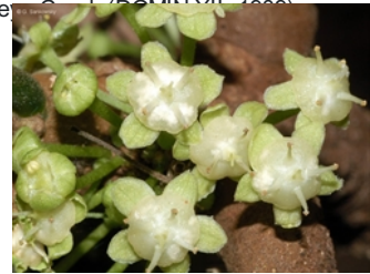
Male flowers [not vouchered].