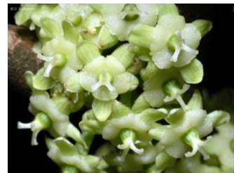
Female flowers [not vouchered]. ©