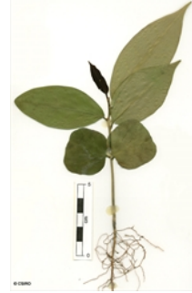
Cotyledon stage, Epigeal germination.