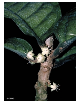
Male flowers.