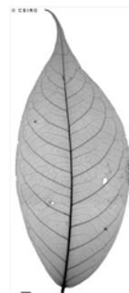
Scale bar 10mm.