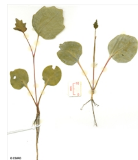
Cotyledon and 1st leaf stage, epigeal germination. © CSIRO

Copyright © CSIRO 2020, all rights reserved.