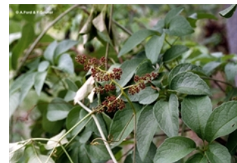
Leaves and Flowers.