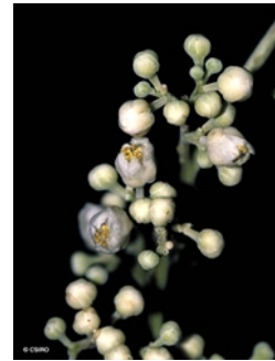
Flowers and buds.