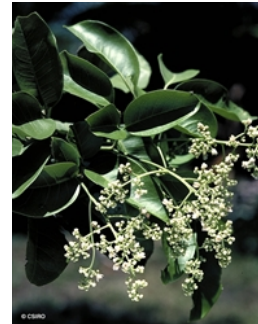
Leaves and Flowers. © CSIRO