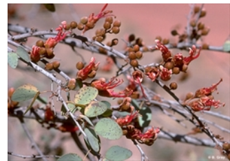
Leaves and Flowers. © B. Gray