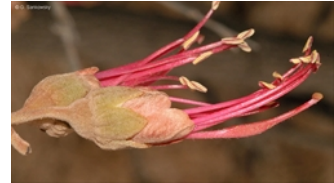
Flowers [not vouchered]. © G. Sankowsky