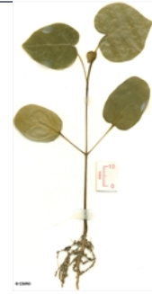
Cotyledon stage, epigeal germination.