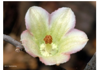
Flower [not vouchered].