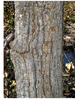
Trunk [not vouchered]. © G. Sankowsky