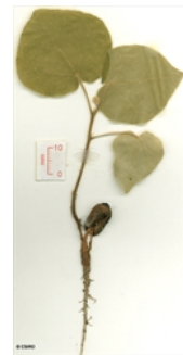
Cotyledon stage, hypogeal germination.