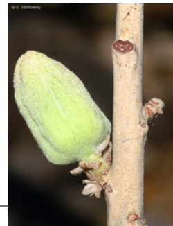
Bud [not vouchered].