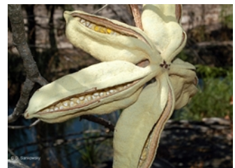
Fruit [not vouchered].