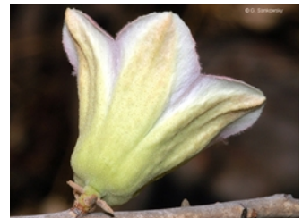
Flower [not vouchered].