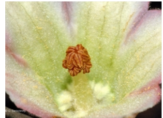
Flower [not vouchered].