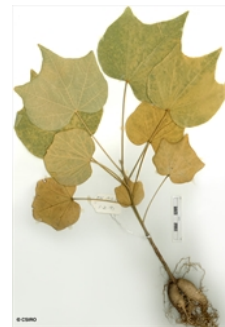
10th leaf stage.