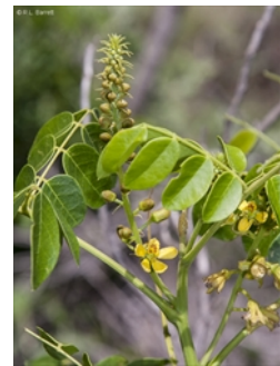
Leaves and inflorescence.