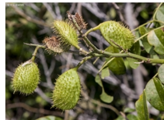
Fruit.