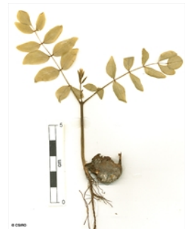
Cotyledon stage, hypogeal germination.