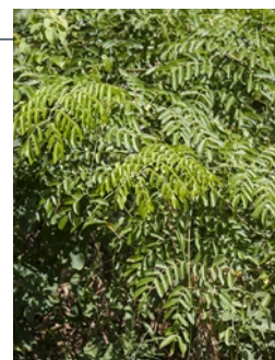
Habit and leaves.