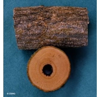
Vine stem bark and vine stem transverse section.