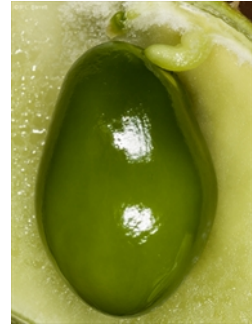
Seed.