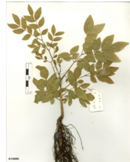
10th leaf stage.