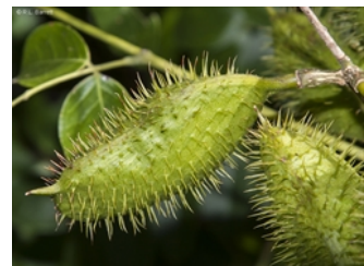
Fruit.