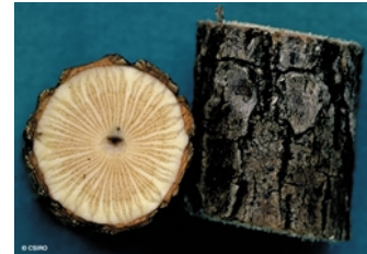
Vine stem bark and vine stem transverse section.