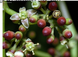
Flowers. © G. Sankowsky