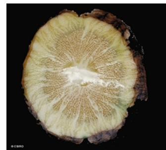
Vine stem transverse section.