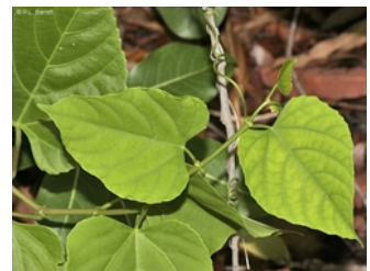
Leaves.