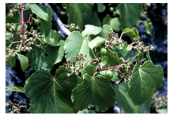
Leaves, flowers and immature fruit.