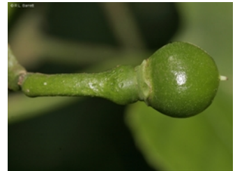
Fruit.