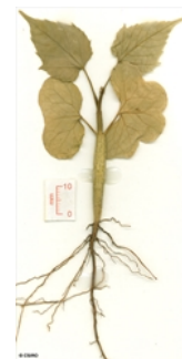
Cotyledon stage, epigeal germination.