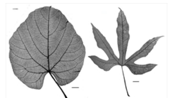
Scale bar 10mm.