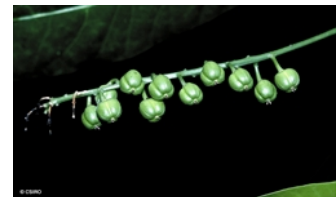
Immature fruits.