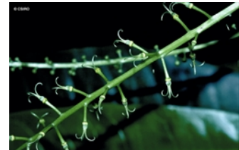
Female flowers.