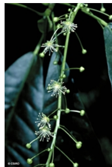
Male flowers.