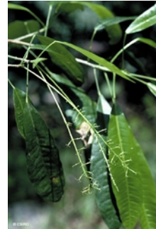
Leaves and female flowers.