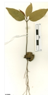
Cotyledon stage, hypogeal germination.