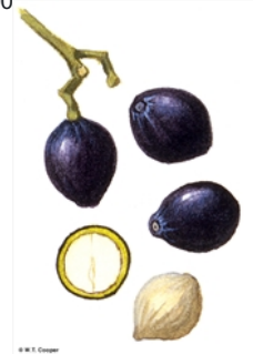
Fruit, three views, cross section and seed. © W. T. Cooper