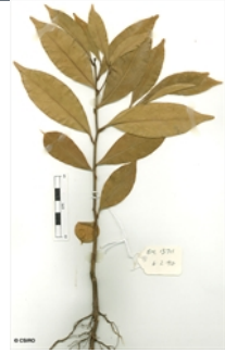
10th leaf stage.