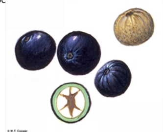
Fruit, three views, cross section and seed. © W. T. Cooper