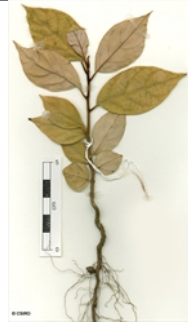
10th leaf stage.