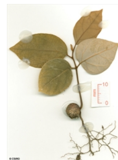
Cotyledon stage, hypogeal germination.