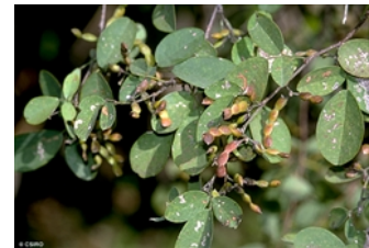
Leaves and fruit.