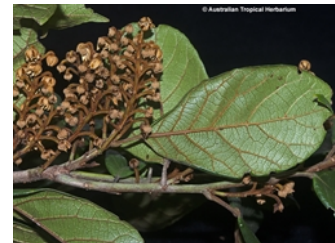
Leaves and flowers.