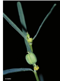
Female flowers.