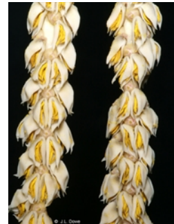
Male and female flowers [not vouchered]. © J.L. Dowe