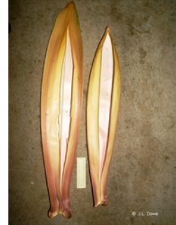
Inflorescence bracts, prophyll (left) and peduncular bract (right) [not vouchered].