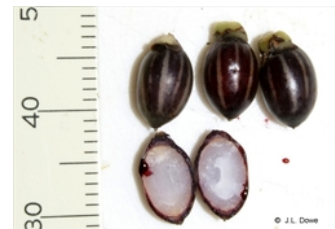
Fruit, whole and in longitudinal section [not vouchered].