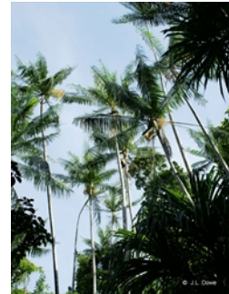
In lowland swamp forest [not vouchered]. © J.L. Dowe