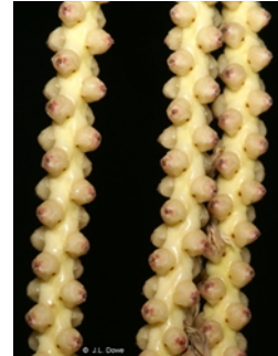
Female flowers after flowering [not vouchered].