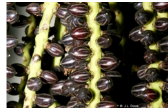
Mature fruit [not vouchered].