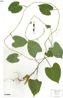
10th leaf stage.