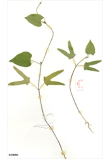
Cotyledon stage, epigeal germination.