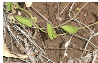
Habit and leaves.