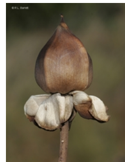
Fruit.