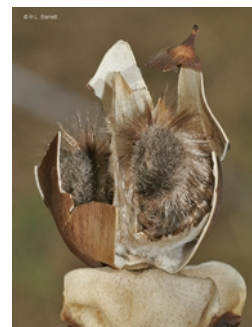
Dehiscent fruit.