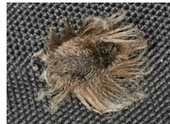
Seed.