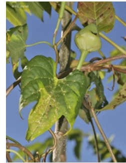
Leaf and fruit.