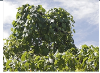
Habit.