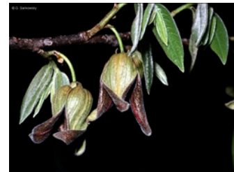
Flowers [not vouchered].