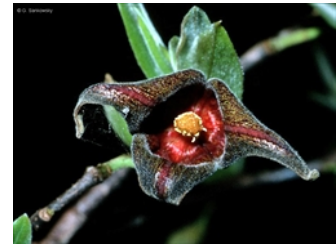
Flowers [not vouchered].