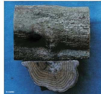
Vine stem bark and vine stem transverse section.