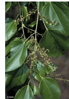
Leaves and male flowers.