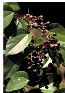
Leaves and fruits.