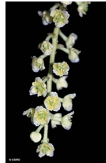
Female flowers. © CSIRO